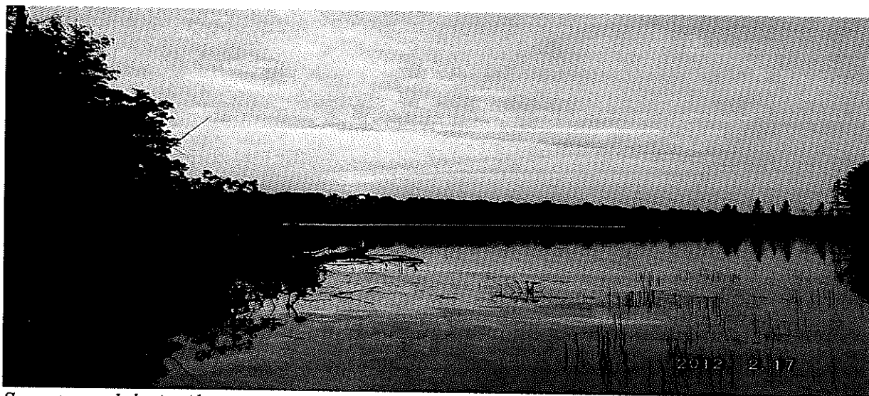
Sunset on a lake in Almaquin